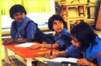
23 + 55. It all adds up in making my future rosy

For over 15 years, we at VOICE (Voluntary Organisation in Community Enterprise) have been reaching out to vulnerable and neglected street children, especially girls, and through education are enabling them to become whole human beings and self-reliant, responsible, contributing citizens.