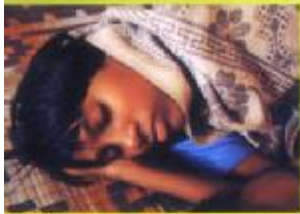
Fairy winks. Sweet dreams.

During this time, we discovered that educating the street child is only part of the solution. Because, without the safety and support of a caring family and a structurally sound home, education becomes near impossible. This holds true especially for female children, who end up facing sexual abuse on the streets. We have found it difficult to retain young girls in recent years, since most of them are forced into childhood marriages for a mere 50 rupees, or more horribly, sold into prostitution.