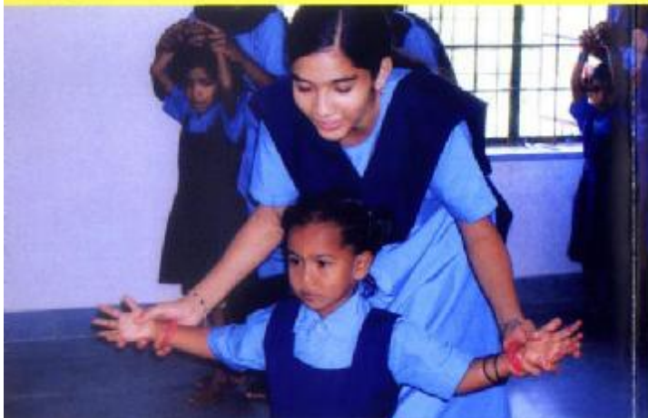
A helping hand to keep her on her feet

During this time, we discovered that educating the street child is only part of the solution. Because, without the safety and support of a caring family and a structurally sound home, education becomes near impossible. This holds true especially for female children, who end up facing sexual abuse on the streets. We have found it difficult to retain young girls in recent years, since most of them are forced into childhood marriages for a mere 50 rupees, or more horribly, sold into prostitution.