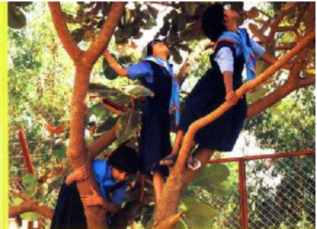
We're on top of the world

Do help us help the needy girl street child. Your contributions won't just give her a roof over her head—they'll give her a life.