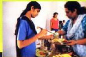
A taste of the good life

Operational from August 31, 2006, Sanjivani will eventually house 100 girls. We also plan to reach out to 500 children from nearby tribal villages and provide them with opportunities for education and skill training.