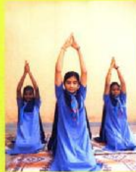
Rejuvenation for body and soul